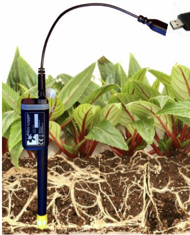
Simple readout of the data with a USB stick

The PlantCare Mini-Logger is a maintenance-free sensor which records soil moisture and soil temperature. A USB stick is used to easily program the mini-logger and readout the data. The PlantCare DataViewer Software allows a quick and easy display and analysis of the measured data. Fields of application are scientific research, agriculture and garden and landscaping construction.