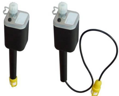
Available in different length as stick or cable version